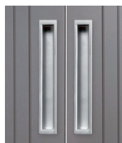
Tirador embutido Poignée encastrée Embossed handle