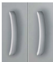
Corporativo Corporative Corporate